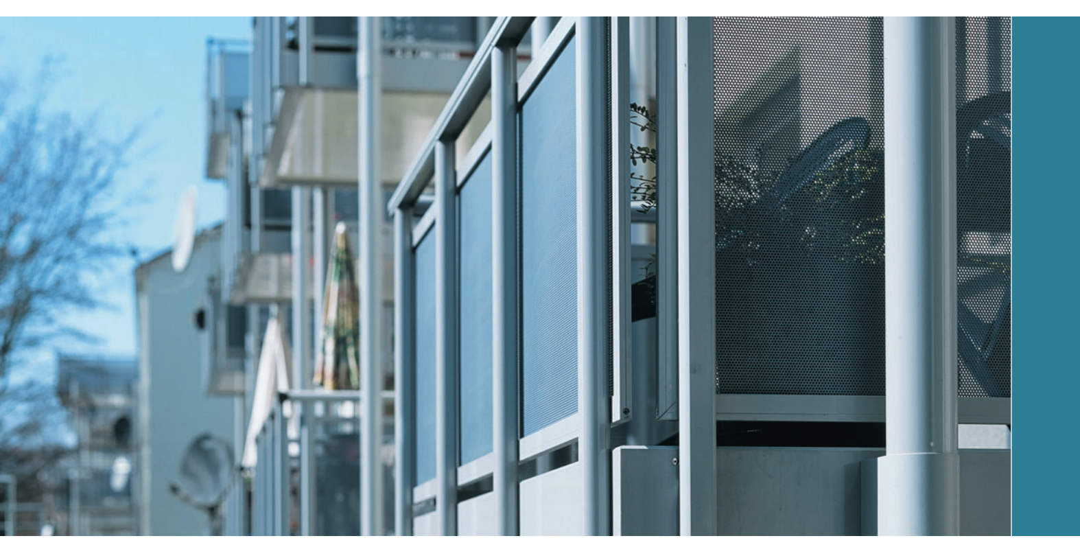
January 1 to June 30, 2005 Interim Report